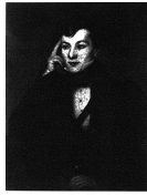
Richard Cobden 1812-1865