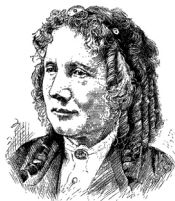
MRS. H. B. STOWE.