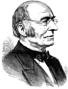
WILLIAM LLOYD GARRISON.