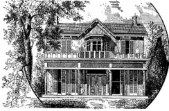
HIS PRESENT HOME AT WASHINGTON

could be no correspondence was very painful. It is my opinion that thousands more would have escaped from slavery but for the strong affection which bound them to their families, relatives, and friends. The daughter was hindered by the love she bore her mother, and the father by the love he bore his wife and children, and so on to the end of the chapter. I had no relations in Baltimore, and I saw no probability of ever living in the neighbourhood of sisters and brothers; but the thought of leaving my friends was the strongest obstacle to my running away. The last two days of the week, Friday and Saturday, were spent mostly in collecting my things together for my journey. Having worked four days that week for my master, I handed him six dollars on Saturday night. I seldom spent my Sundays at home, and for fear that something might be discovered in my conduct, I kept up my custom and absented myself all day. On Monday, the third day of September, 1838, in accordance with my resolution, I bade farewell to the city of Baltimore, and to that slavery which had been my abhorrence from childhood.