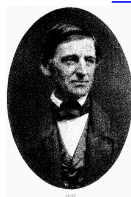
Ralph Waldo Emerson in 1854