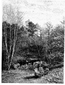
Concord Woods in May