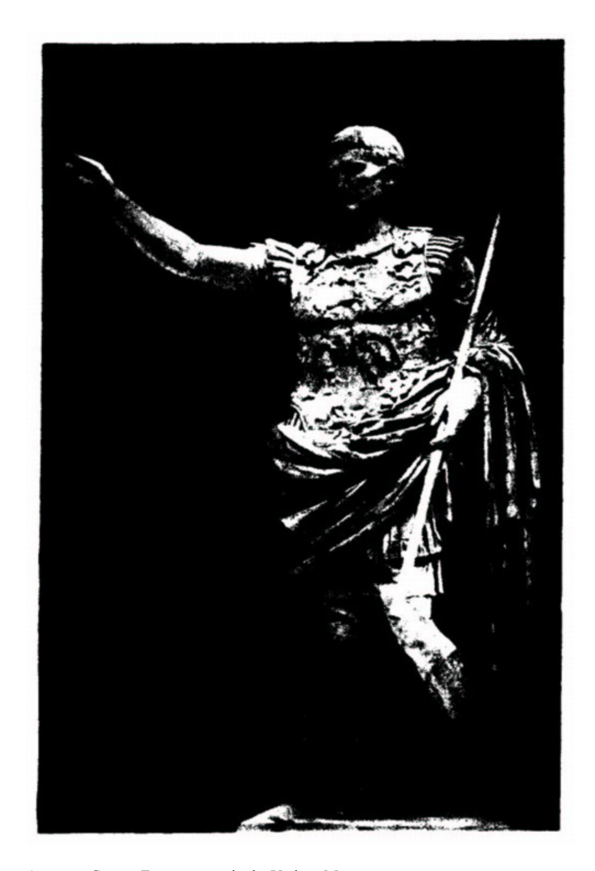
Augustus Caesar. From a statue in the Vatican Museum