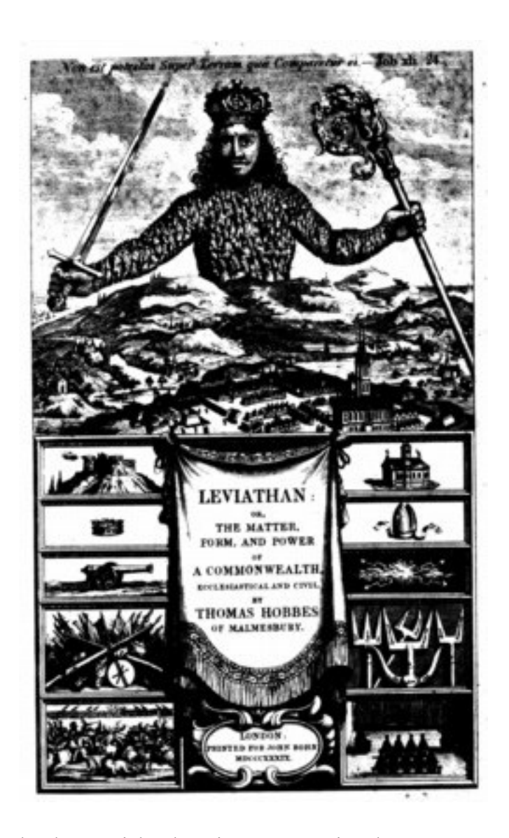
london: c. richards, printer, st. martin's lane.