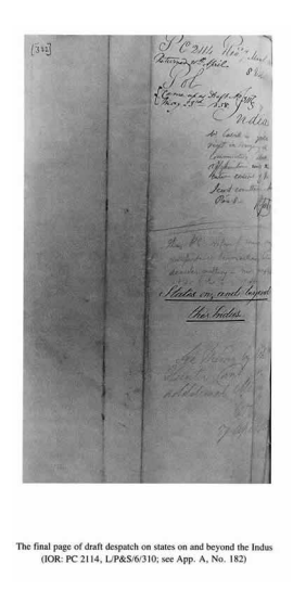
>The final page of draft despatch on states on and beyond the Indus

(IOR: PC 2114, L/P&S/6/310; see App. A, No. 182)